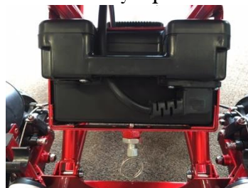
Battery Pin Ring