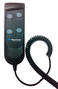
Easy-to-use hand control with Soft-Touch buttons.