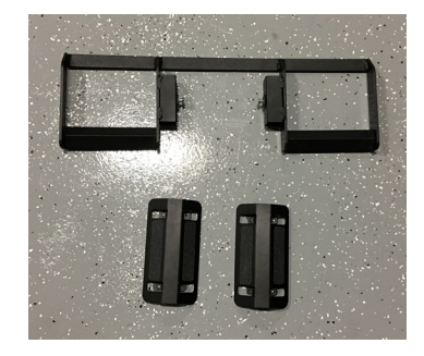
Adjustable 4 Wheel Cradle Kit