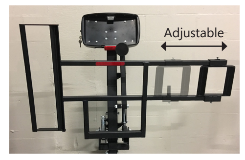
AL015 Micro Lift with Standard 3 Wheel Cradle